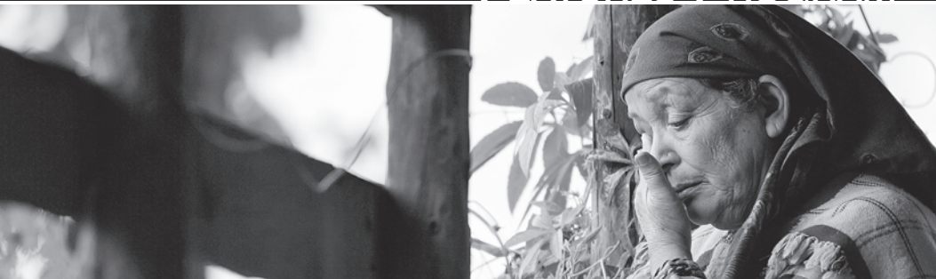
SAANJH (AN EVENING)